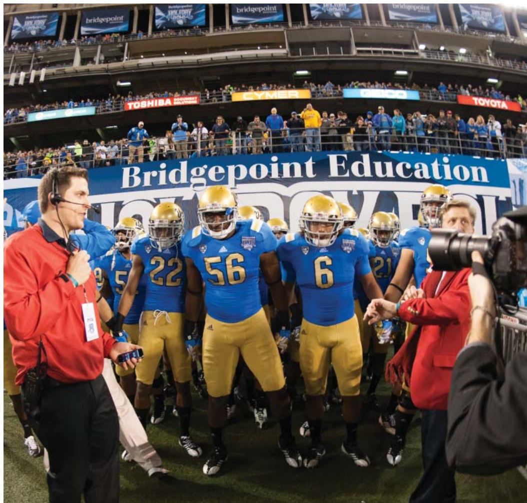
2012 HOLIDAY BOWL